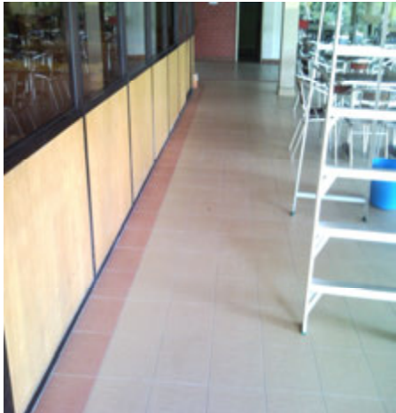
Photo 4 One side of poolside bar area hacking at planter box in progress....