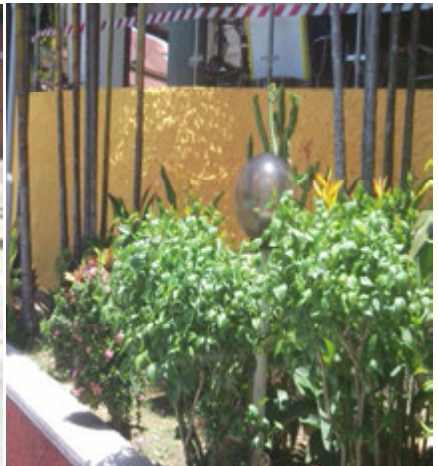
Photo 6 Completion of painting work at round cement wall area.