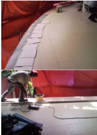
Photo 1 Site mobilization hauling work in progress at poolside bar area....