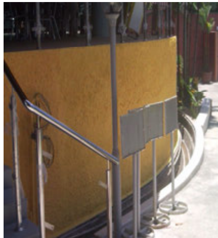
Photo 5 Completion and painting at round wall area view