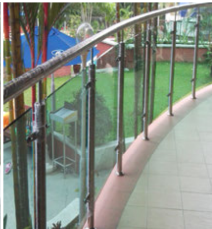
Photo 8 Completion of tempered glass at poolside bar area view