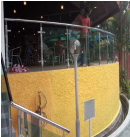
Photo 7 Poolside round wall painting and tempered glass completed.