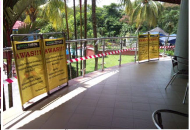
Photo 3 Site mobilization and hacking work commence at poolside bar area view..